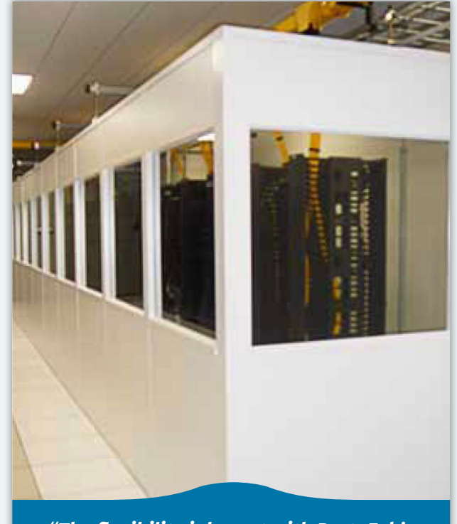
"The flexibility inherent with PortaFab's modular components allows ease of relocation and reconfiguration"

• Modular walls are a low-cost solution to maintaining lower temperatures within the server housing.