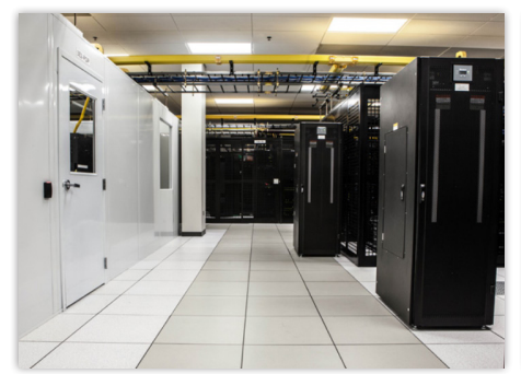
Hot and cold aisle configurations can be accommodated to funnel cool air into the server housing