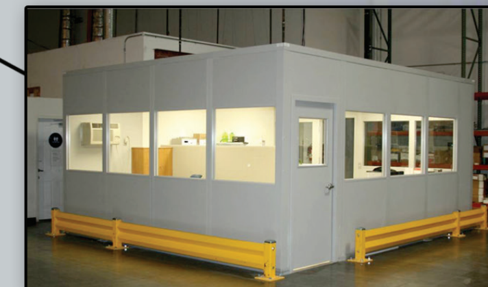
5 DAY "QUICK SHIP" OFFICES