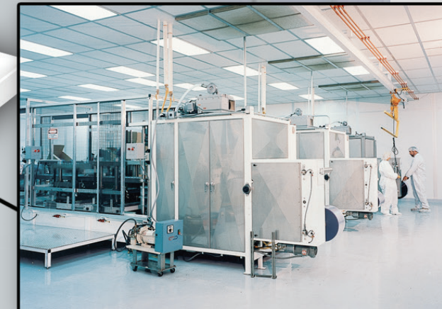
INJECTION MOLDING ROOMS