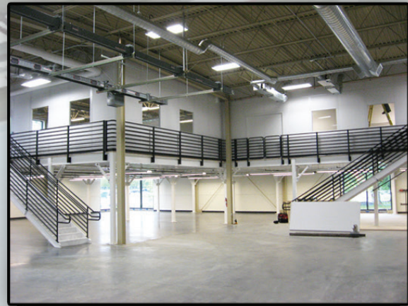
OFFICES ON MEZZANINE

PortaFab's line of pre-assembled buildings and shelters are ideal for use as guard booths and smoking shelters as well as unique applications like cool-down rooms and equipment enclosures.