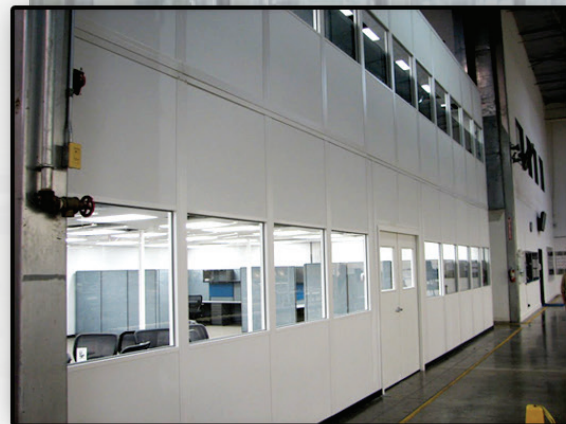
2 STORY OFFICES