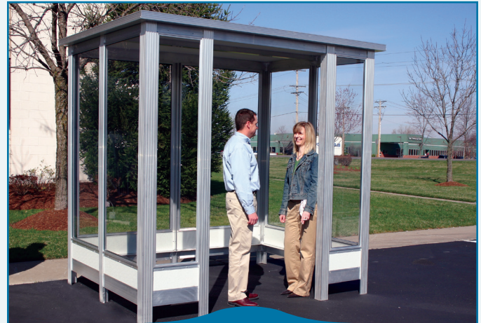
PortaFab shelters come fully assembled and ready for instant use