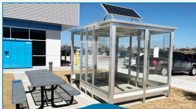
Smoking shelter with solar panels