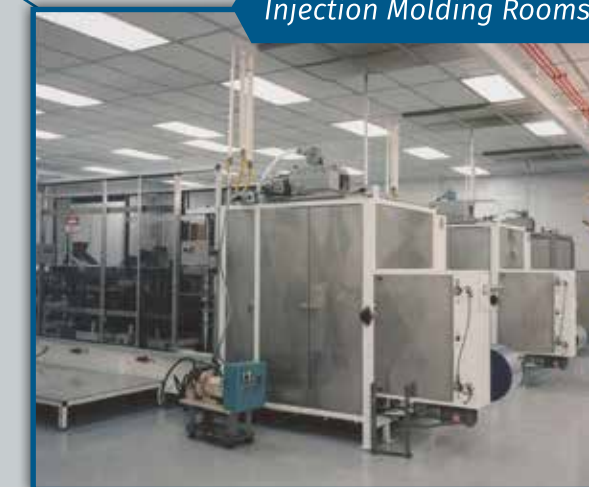
Injection Molding Rooms