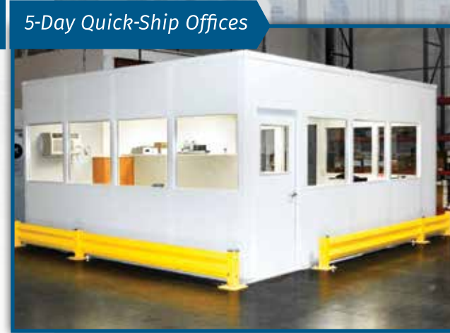
5-Day Quick-Ship Offices