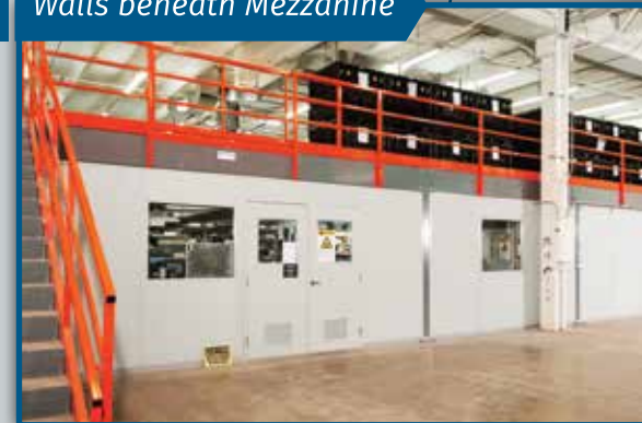
Walls beneath Mezzanine