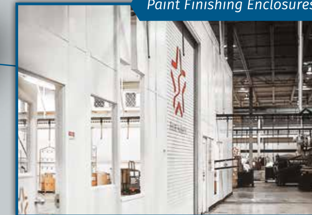
Paint Finishing Enclosures