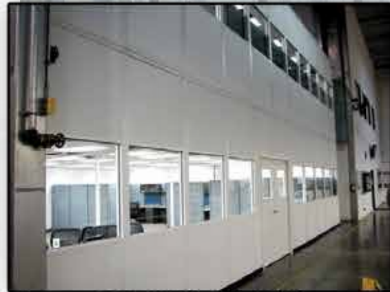
2 STORY OFFICES