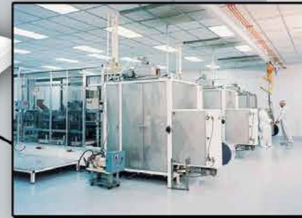
INJECTION MOLDING ROOMS