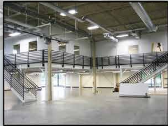
OFFICES ON MEZZANINE

PortaFab's line of pre-assembled buildings and shelters are ideal for use as guard booths and smoking shelters as well as unique applications like cool-down rooms and equipment enclosures.