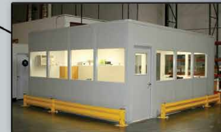
5 DAY "QUICK SHIP" OFFICES