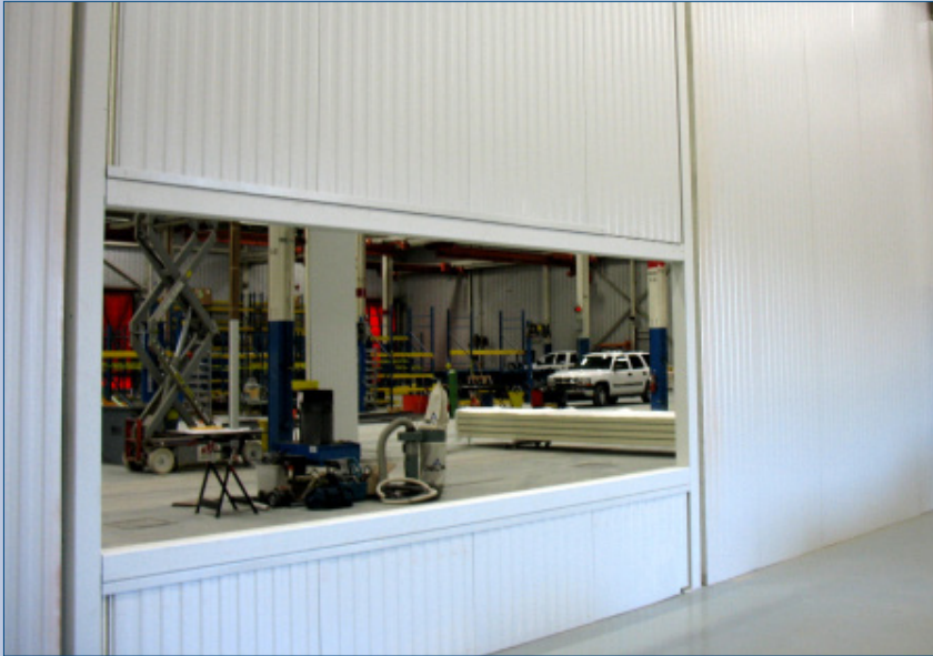
PortaFab engineering can integrate all types of openings into SteelSpan walls.