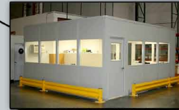
5 DAY "QUICK SHIP" OFFICES