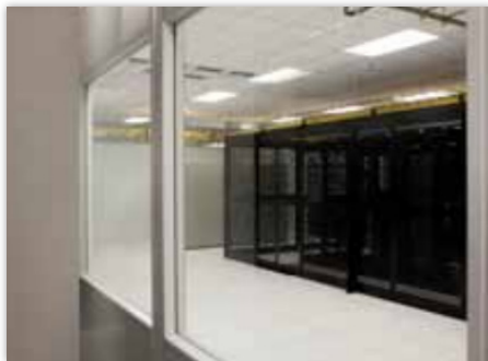
Secured storage enclosures can be created for enhanced privacy.