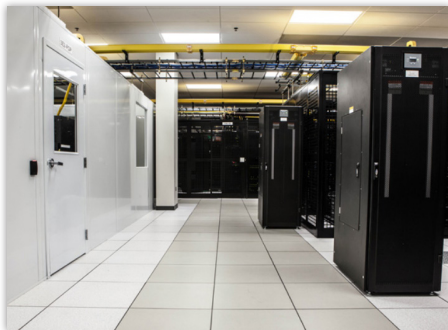
Hot and cold aisle configurations can be accommodated to funnel cool air into the server housing