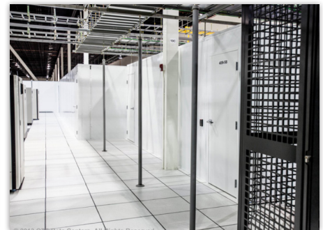
Walls can extend from floor to ceiling, allowing hot air to escape through the roof.